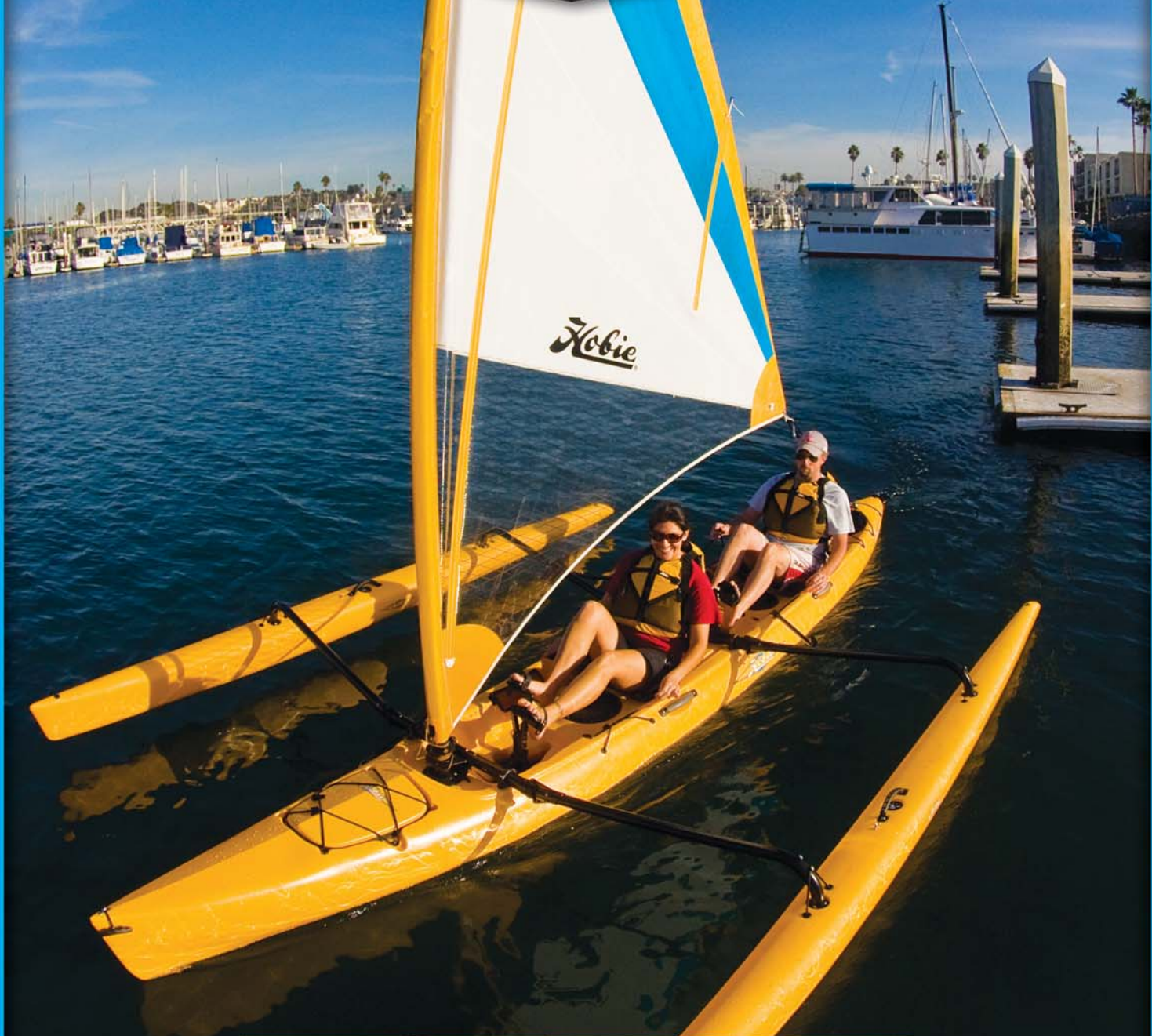
HOBIE MIRAGE TANDEM ISLAND